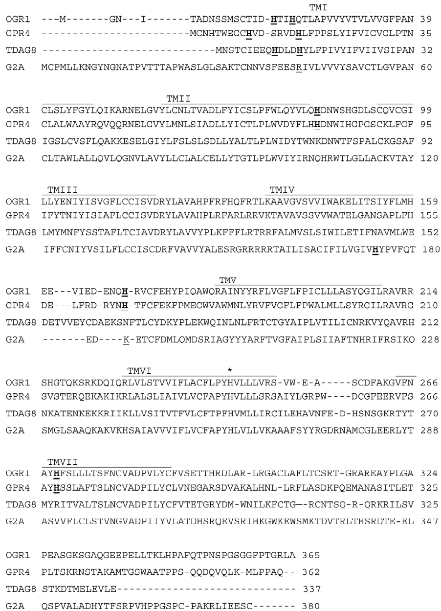
Figure 2. Sequence alignment of OGR1 subfamily GPCRs. Histidine residues that have been reported to be involved in proton-sensing are bolded and underlined in OGR1 (H17, H20, H84, H169, and H269), TDAG8 (H10 and H14), and G2A (H174). Residues in GPR4 that are assumed to be critical for proton-sensing based on alignment with OGR1 are also marked. Suggested basic amino acids in G2A instead of histidines in OGR1 are underlined. A histidine in TMVI conserved in all four members of GPCRs is starred. Potential transmembrane regions are overscored; gaps are indicated by dashes.

However, they were not able to observe any effect of SPC and LPC, previously reported ligands, on OGR1 and GPR4. In 2004, Murakami et al reported that G2A functions as a proton-sensing GPCR [21] . Transient transfection of G2A caused significant activation of the zif268 promoter and IP accumulation at pH 7.6 and lowering extracellular pH aug-